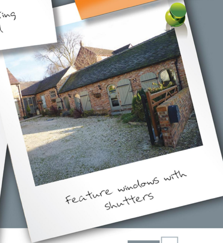
Feature windows with shutters

This project comprised of... * Conversion of two hundred year old barn * Raised rear garden