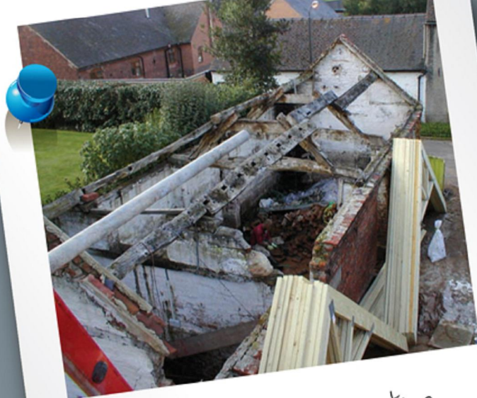
Existing sheds, existing timbers salvaged

This project comprised of... * Conversion of two hundred year old barn * Raised rear garden