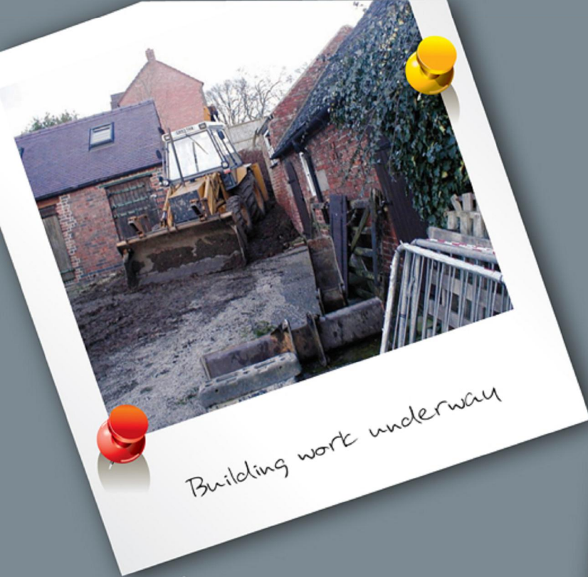
Building work underway