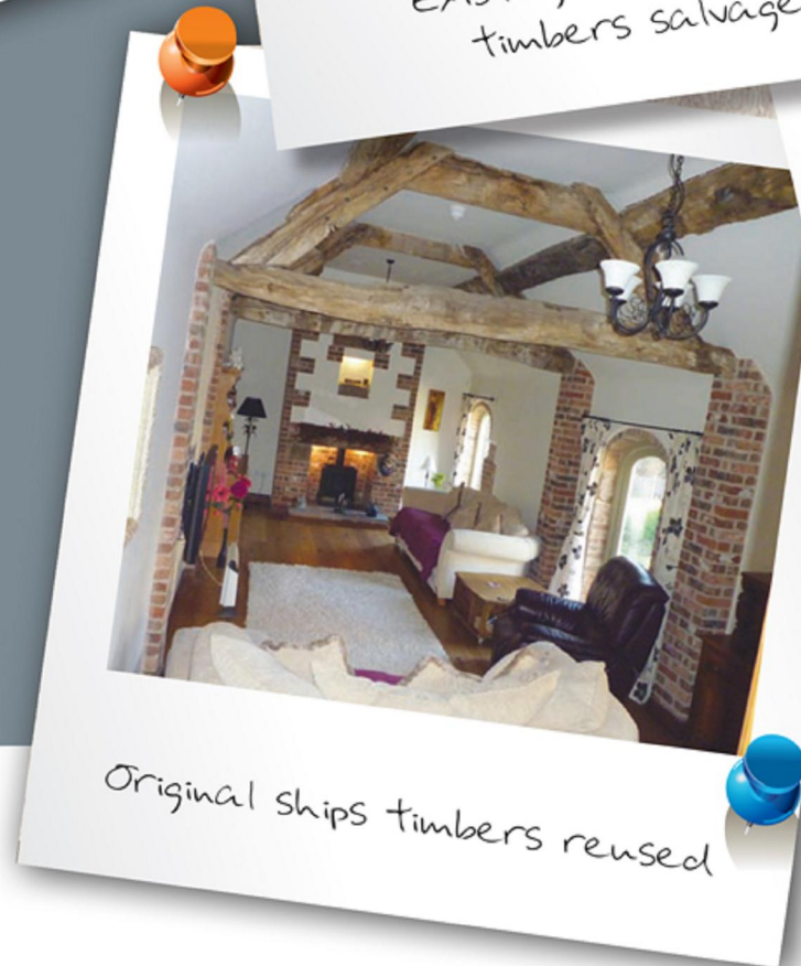
Original ships timbers reused