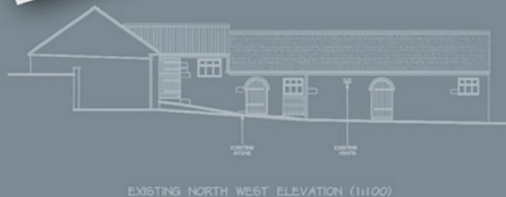
EXISTING NORTH WEST ELEVATION (1:100)