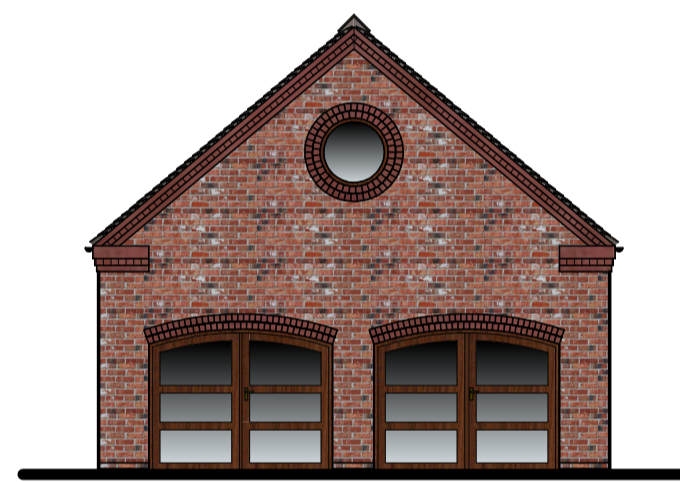
GARAGE FRONT (1:100)