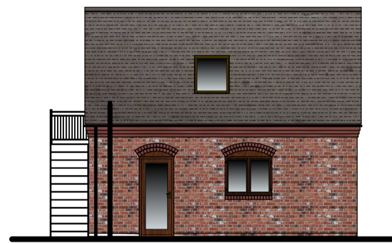
GARAGE SIDE (1:100)