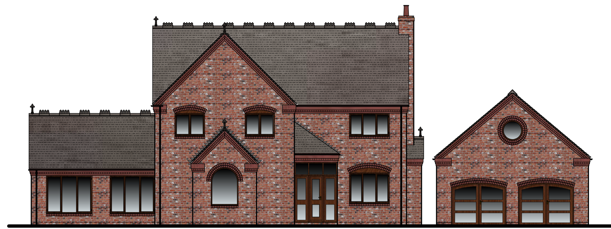
SOUTH ELEVATION (1:100)

All dimensions must be checked on site and not scaled from this drawing