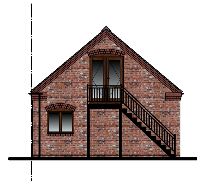
GARAGE REAR (1:100)