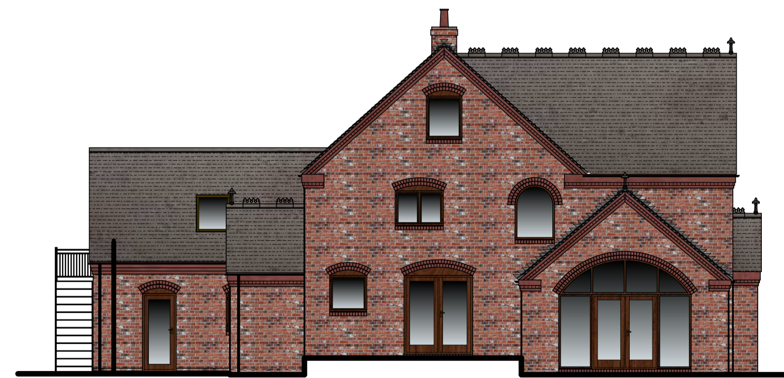
WEST ELEVATION (1:100)