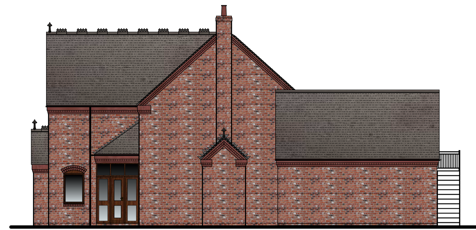
EAST ELEVATION (1:100)