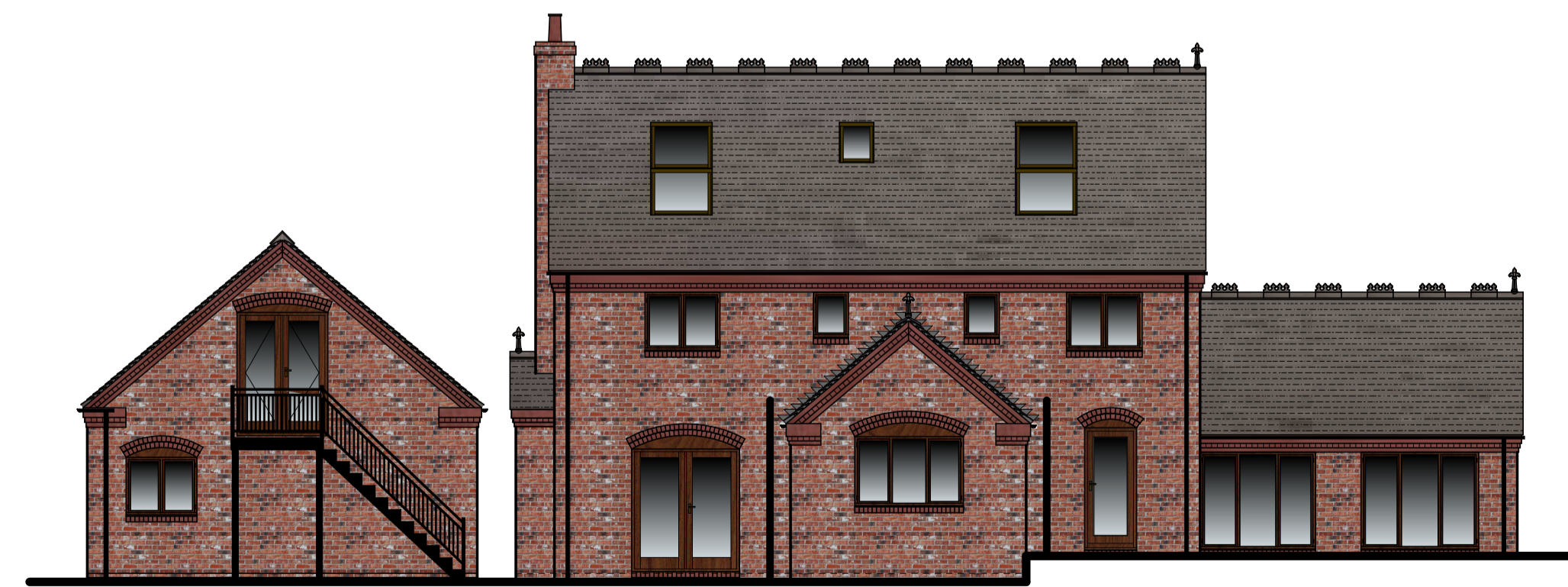
NORTH ELEVATION (1:100)