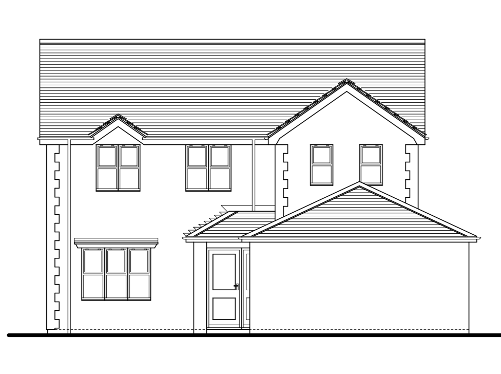
EXISTING FRONT ELEVATION (1:100)

All dimensions must be checked on site and not scaled from this drawing