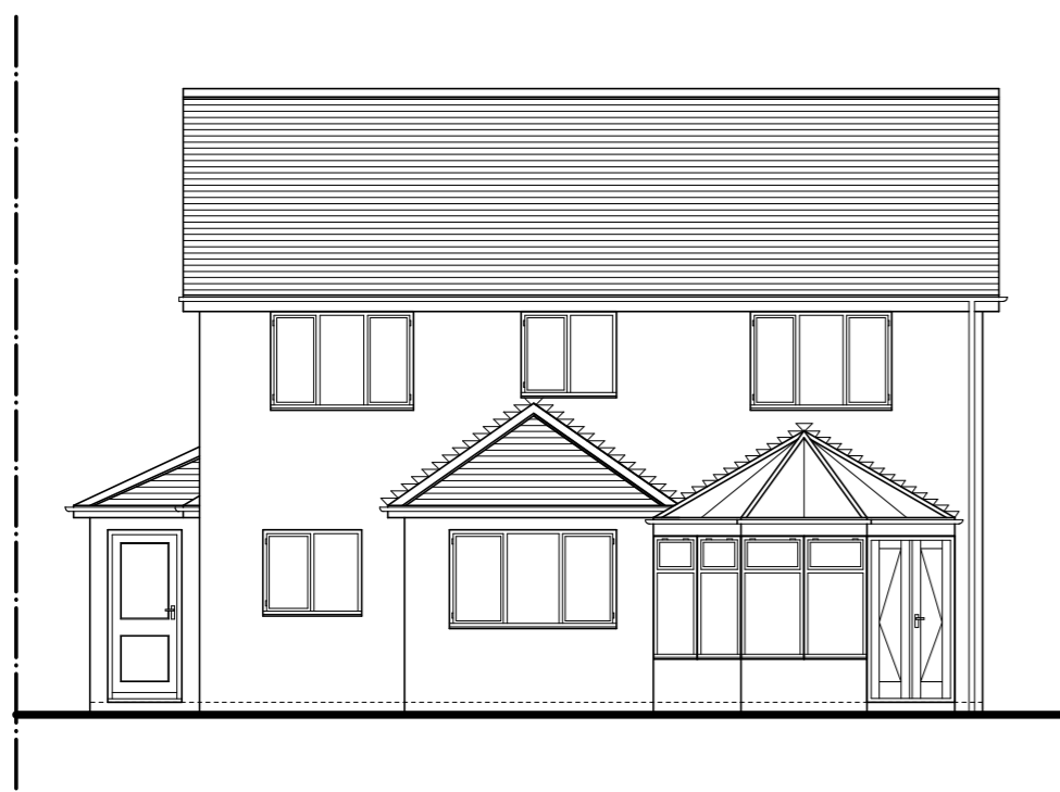
EXISTING REAR ELEVATION (1:100)