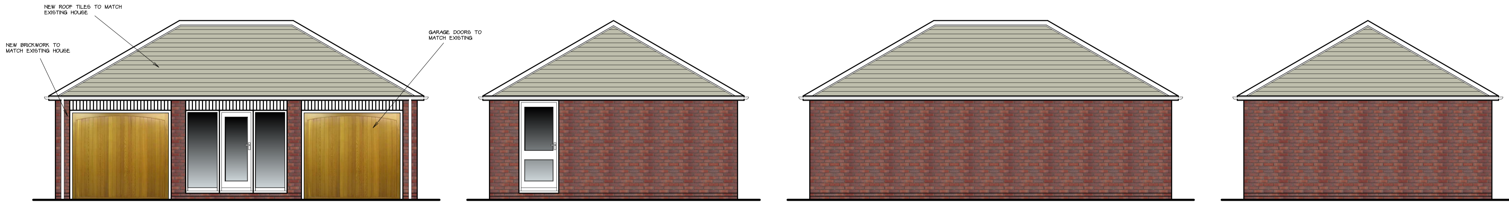
PROPOSED SOUTH EAST ELEVATION (1:50)

All dimensions must be checked on site and not scaled from this drawing