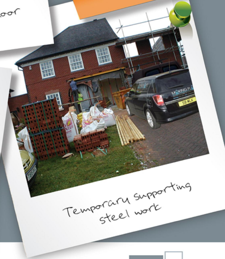
Temporary supporting steel work