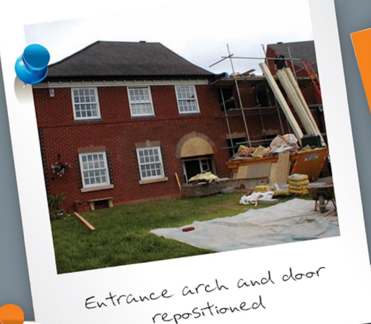
Entrance arch and door repositioned