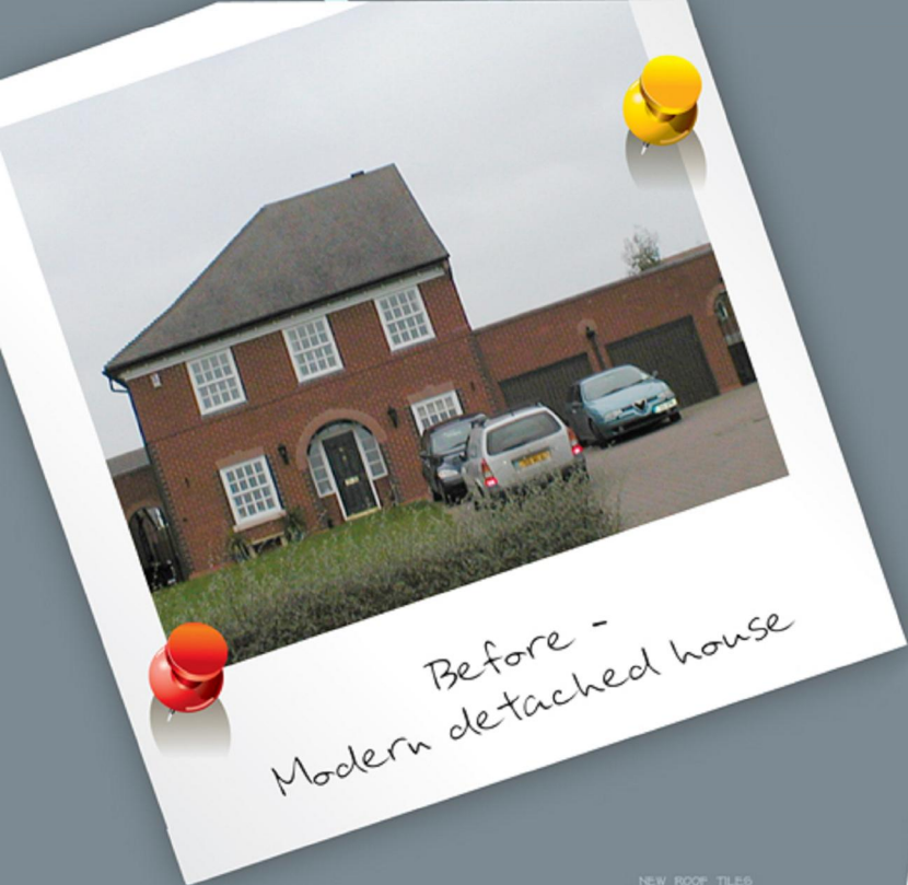
Before - Modern detached house