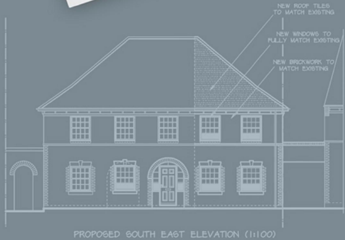
PROPOSED SOUTH EAST ELEVATION (1:100)

This project comprised of... *32ft kitchen diner *Master bedroom with en-suite